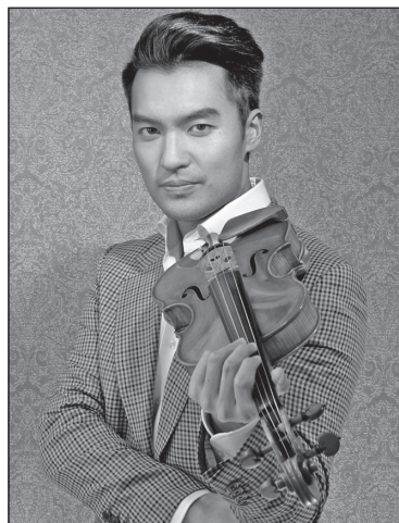
Violinist Ray Chen