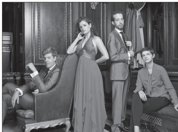
Ariel String Quartet