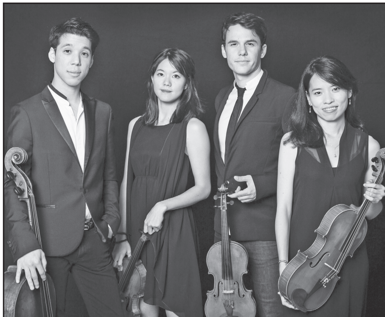
Hermes String Quartet from Paris

The Festival’s 40th Celebration will also include