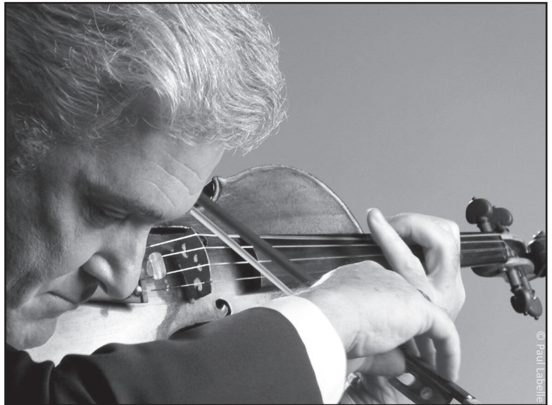
Legendary Violinist/Violist Pinchas Zukerman

We are planning a true blockbuster season to celebrate our milestone 40th anniversary in the summer of 2021 with some of the world’s finest musicians again gracing the mountains