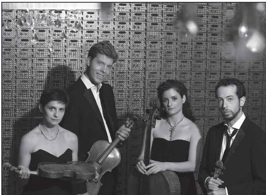
Ariel String Quartet