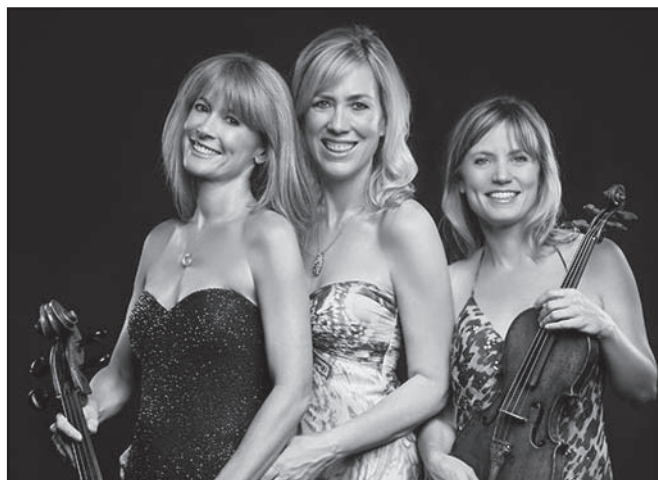
The Eroica Trio