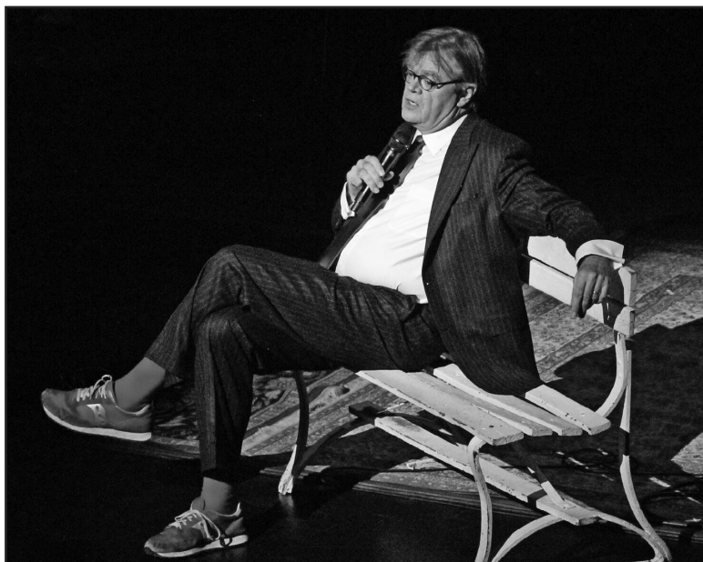
Garrison Keillor debuts on November 10th

We have TWO special programs for you this fall – our Fall Residency will feature a brilliant young String Quartet, the Lieto