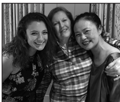
The Other Three Graces

Heart-felt thanks to all who supported the Festival by making a monetary contribution, underwriting a concert, sponsoring a special event, housing a musician, hosting a feast, salon or concert reception, attending a concert or becoming a member of the Legacy Society.