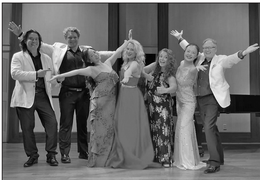
Our Fantastic Gala – 2023