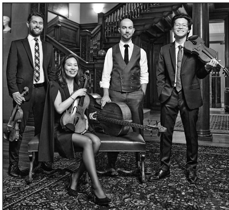
Dover Quartet – 2024 Debut